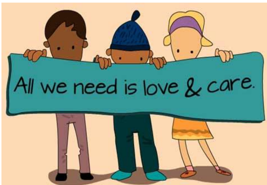
Child abuse/ samanthacodd.wordpress.com 2

The most painful abuse for any child is not only physical violence but rather the neglect to his/her needs. They suffer from a lack of love and emotional comfort and security when neglected.