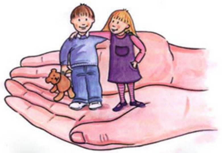
Child abuse/ 3

You can go to the Youth Welfare Office or worst case scenario you could go to the police. If you do not help, there will be consequences. Abuse at a young age has an impact on a person's later life. Now you know that child abuse comes in different forms and if you have ever heard of a case, ask professionals for help or offer some support.