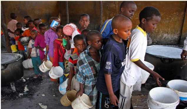
Famine 1

Famine can be caused by violence, displacement, wars and natural disasters. The situation is also worsened by the lack of medical care and clean drinking water. The cause of famine in Africa is the drought that has raged there for over 60 years. Many parts of Africa can no longer be planted and sometimes the rain season fails completely, which is why the still fertile countries can slowly no longer be used for harvesting. Because of war, people have to leave their houses, countries and everything they earned on their own, the only thing they take with them is hunger.